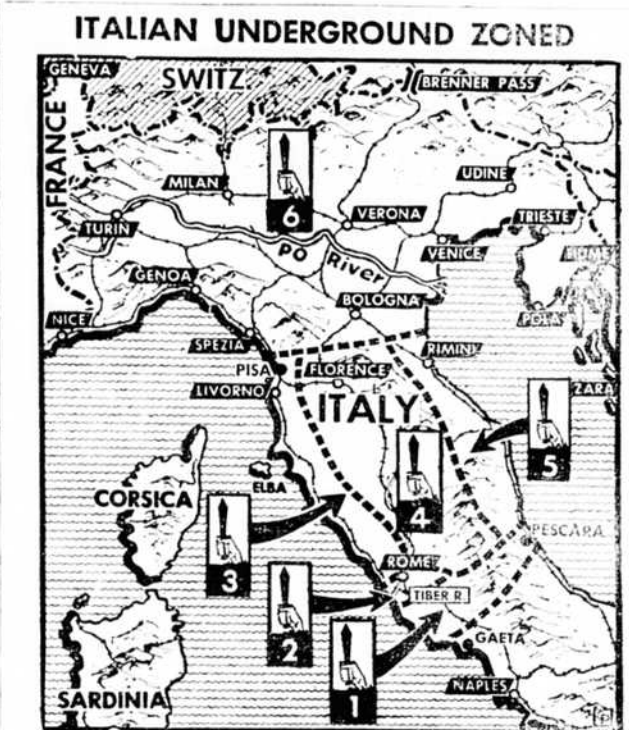
THE ALLIED High Command has divided Italy into six zones in which the "underground" is to "prepare for action" when directed by them and play their particular parts in the big Italian campaign now under way. These districts, as shown in the map, are: (1) areas immediately behind the present front lines of the Fifth and Eighth armies; (2) areas around Rome; (3) a coastal strip from the Tiber River north to Pisa; (4) the entire Apennine region; (5) the Adriatic coast from Pescara to the north of Rimini; (6) all sections north of Rimini and Pisa.