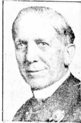
CLYDE R. HOEY