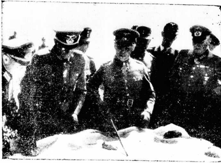
Here is the first photo taken of Field Marshal Erwin Rommel at his new and invasion headquarters, somewhere in France as the Nazi military leader planned moves to counter the Allied drives inland from the beaches of France. His generals listen as he explains his strategy while looking over a map held down by small pieces of stone. The photo was radioed from Stockholm to New York.