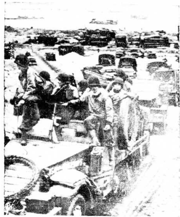
BOUND FOR THE FRONT, a U.S. half-track army up a hill on the main road after taking on a load of supplies from the front in the background. If the Allies are successful in taking the great port of Cherbourg, its fine docks will facilitate the landing of war material.