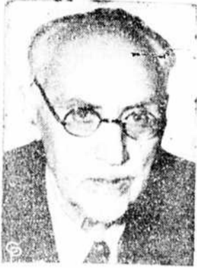
THIS PHOTO of Benito Mussolini, Premier of Italy, was taken in Rome, Italy, in 1938. He is wearing a dark suit and glasses.