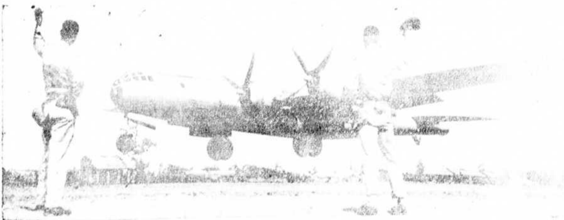
TWO AMERICAN GROUND CREWMEN are seen in the foreground as the B-29 Superfortress bomber takes off from the runway at Wendover Field, Utah, Aug. 25, 1941.