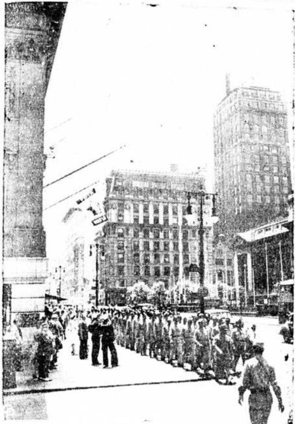
ENJOYING THEIR FIRST PASS since brought to this country, 163 former prisoners of war, now volunteers in the Italian Service Unit on non-combat duty at Camp Shanks, N. Y., march up Fifth Avenue on a one-day sight-seeing tour of Gotham. These men have pledged themselves to aid our war effort—short of actual combat.