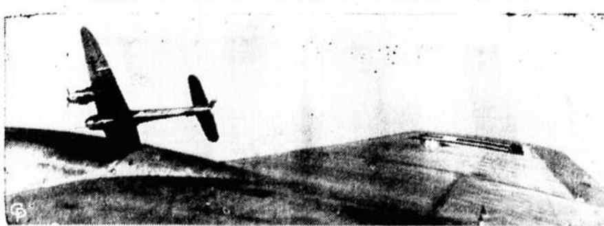
LESS THAN 25 FEET CLEAR of the wing of an American Flying Fortress is a Nazi Messerschmitt 109, pictured just as it pulled away to dive from the path of the Fortress. The photo was made from the B-17 bomber 'Lady Godiva' by Sgt. Victor A. LaBruno, 22, combat photographer, of Jersey City, N. J., when 100 German fighters attacked a U. S. 8th Air Force formation bent on bombing synthetic oil plants of the enemy at Brno, gave the Czechoslovakian border, U. S. Army Air Force photo.

WASHINGTON, June 21.—(AP)—The U. S. Navy today reported that the Japanese fleet had been spotted in the western part of the Pacific, and indicated that some of the ships were in the area.