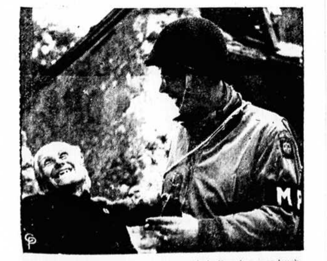
AN AMERICAN PARATROOPER MP and an elderly French woman laugh joyfully over a funny story in the shell-torn streets of Ste. Mere Eglise, France. The Yank is shown holding a bottle of home-made wine that the old woman hid from the Nazis in a cave.