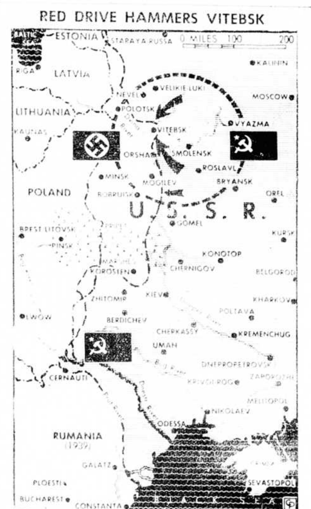
PENETRATION of the German line north and south of Vitebsk, the Red Army's important gain today by the Russian army in the east. The breakthrough was made by the 10th Army, which had been ordered to break through the German line at Vitebsk.

Germany said more than 60,000 Germans had been killed, 8,000 of them in the area south of Vitebsk alone. Hundreds of tanks, trucks and other equipment also had been seized.