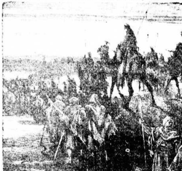
The Hebrews passing over Jordan.

"Be strong and of good courage, be not afraid, neither be thou dismayed: for Jehovah thy God is with thee whithersoever thou goest." —Joshua 1:9