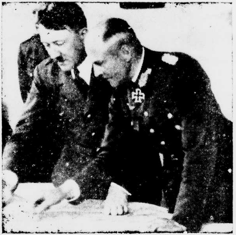
Hitler and his chief military adviser, Col. Gen. Alfred Jodl, according to the Berlin radio, an assassin's bomb burst and bruised the Nazi Fuehrer and slightly injured Jodl.