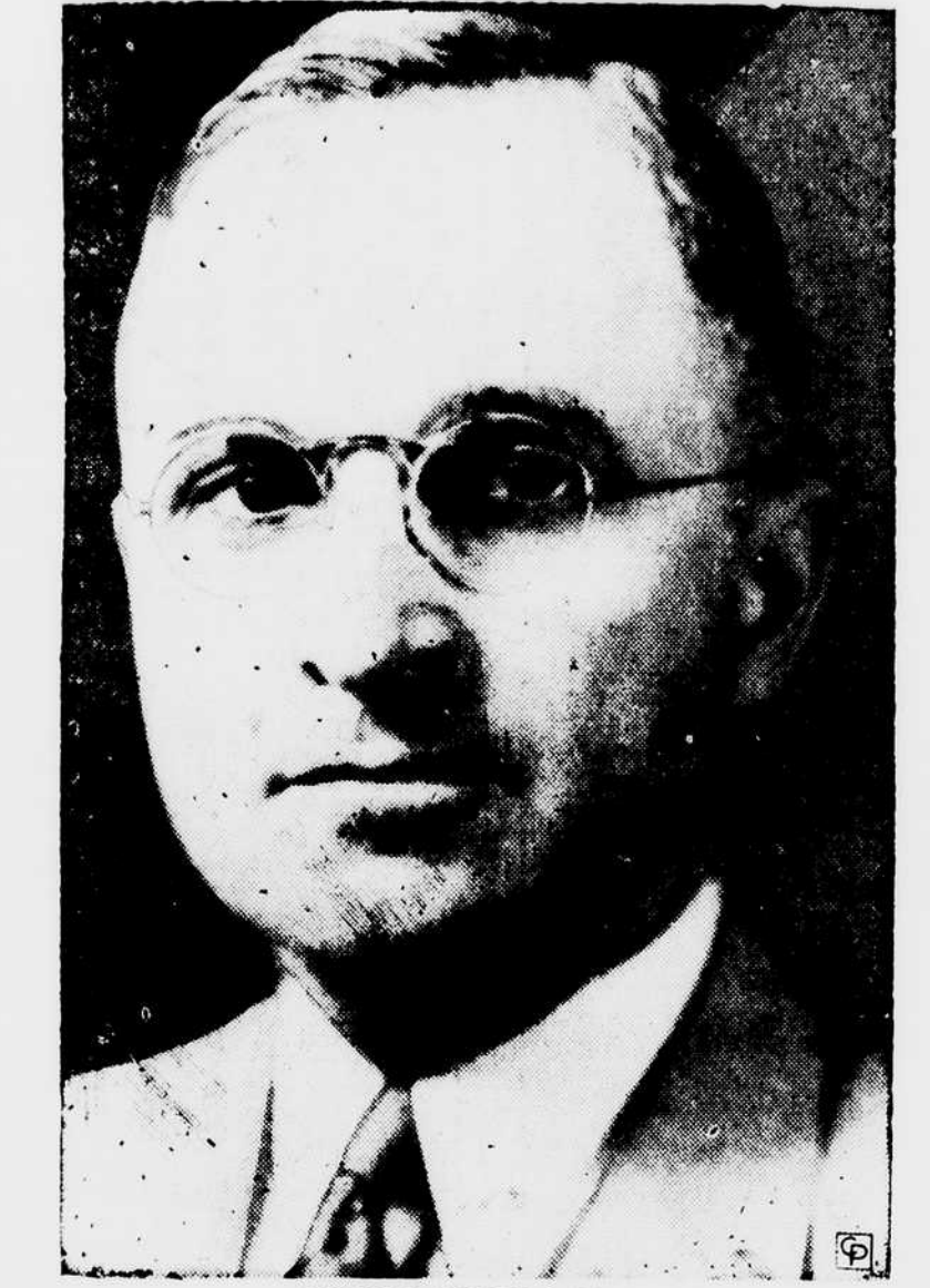
SENATOR HARRY S. TRUMAN