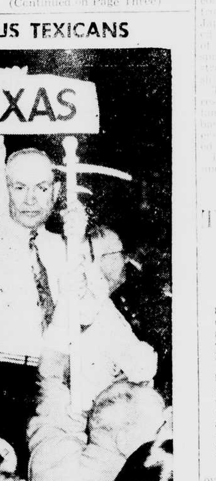
THESE DELEGATES from Texas, photographed at the Democratic Convention in Chicago, are among the group of dissenters from the Lone Star state who have figured prominently of late in the political news.