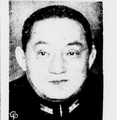
IT HAS BEEN revealed by the Japanese Domei news agency that Gen. Kuniaki Koiso (top), Governor-General of Jap-occupied Korea, and Adm. Mitsumasa Yonai (bottom), former Jap premier, have been chosen by Emperor Hirohito to form a new government. It will replace that of the ousted Premier, Hideki Tojo.