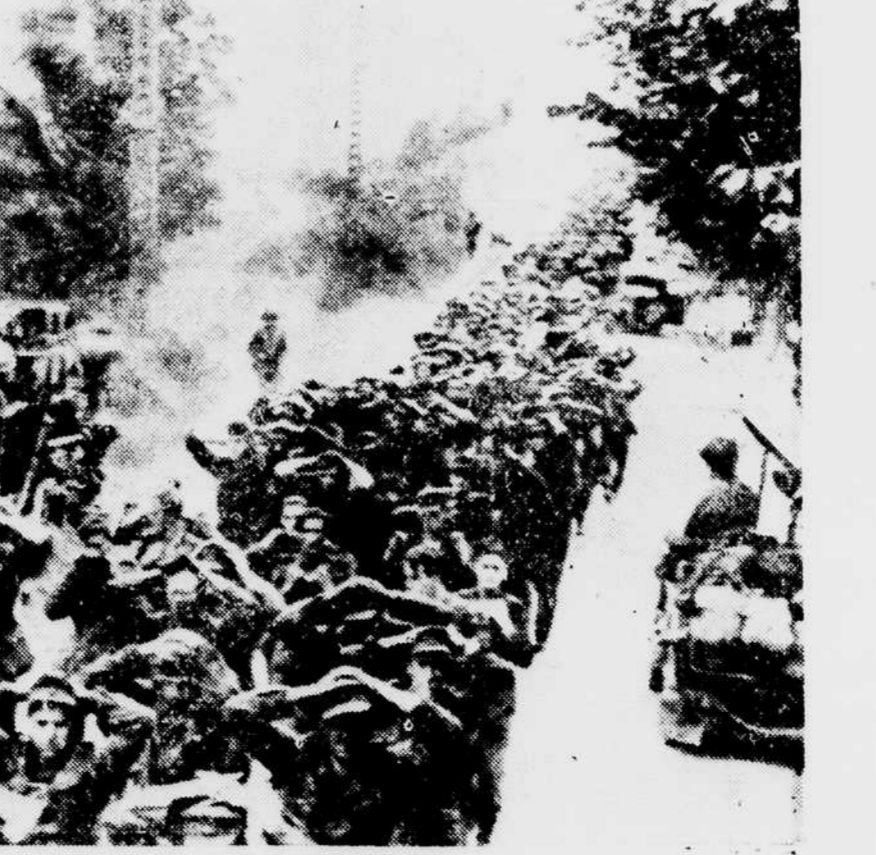
BY THE HUNDREDS AND THOUSANDS, the German troops from Avranches to Rennes and to the coastal tip of Brest have been surrendering as the U. S. forces raced across the Breton Peninsula with a tank-and-man smash that will not soon be forgotten. With hands on heads, the big parade of enemy prisoners marched directly into the camera. This is but one of many similar pageants of defeat, being enacted at Brest, St. Nazaire, St. Malo, Lorient and other points of collapse on the Brittany coast.