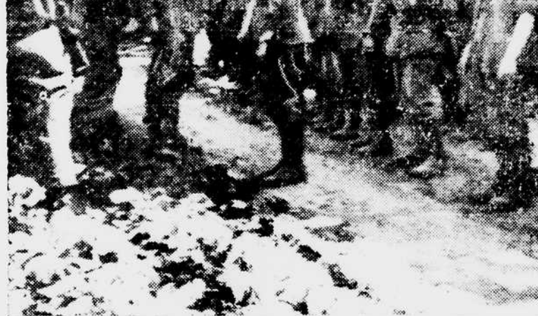
A CEXMAN SERGEANT surrenders his platoon en masse to an American army officer after the Nazi unit was trapped near St. Lo, France. All but the commanding general and few staunch followers have given up at St. Malo

Washington, Aug ^{1}\mathrm{L}-(\mathrm{AP}) - Chairman Reynolds, North Carolin Democrat, of the Senate Military Af Ceaseless Air Attacks fairs Committee, called upon Sec tary of War Stimson today for an ficial explanation of published ports that "lack men" amon famed Merrill's Marauders Upon Cracking Germany called upon to defend the Mylticyina