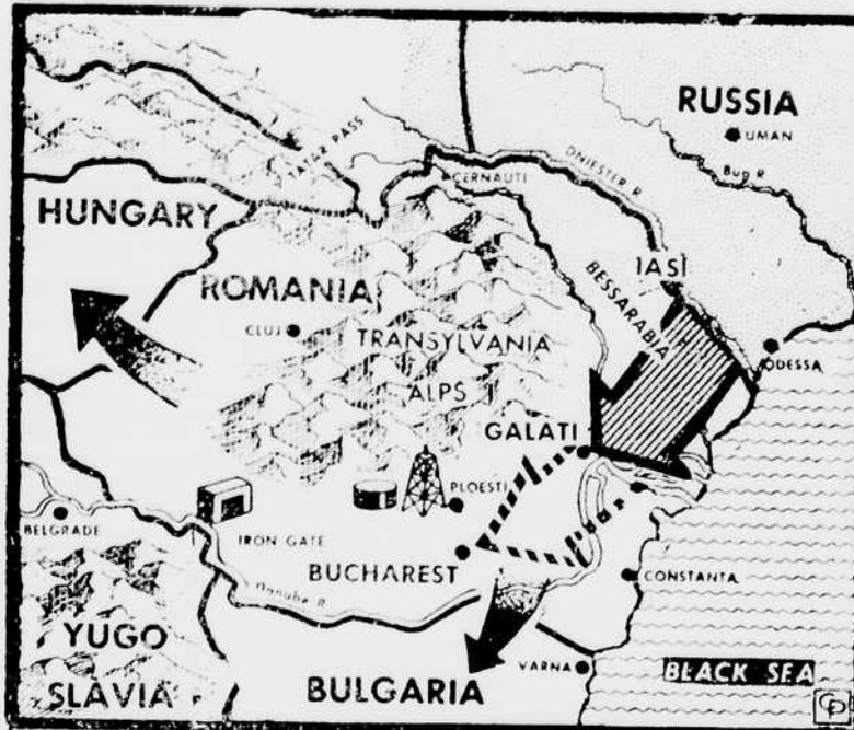
SWIFTLY FOLLOWING the news that Romania had joined the Allies is the report from London that Romanian troops are marching on Hungary. Bulgaria was expected to follow Romania's lead at any moment, while the Russians pushed into the heart of the oil and wheat belt around Galati and Ploesti with the possibility that large Nazi units in the Balkans might soon be trapped.