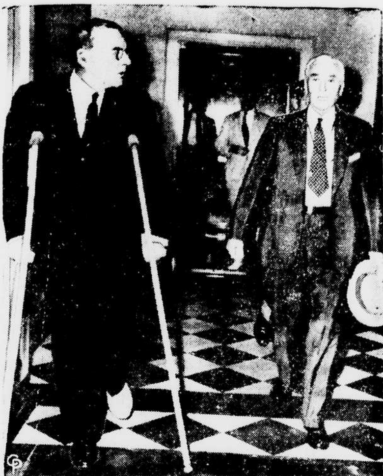
JOHN FOSTER DULLES, foreign affairs expert for Gov. Dewey, Republican presidential candidate, arrives at the U. S. State Department on crates for his discussions with Secretary of State Hull. Dulles, who is recovering from a foot injury, will talk over post-war peace.