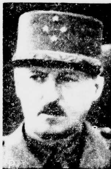
HERE IS A CLOSEUP photo of Lt. Gen. Joseph Pierre Koenig, commander of the French forces of the Interior and Military Governor of Paris. He appeared to the Parisians to safeguard their food supplies and maintain order until a new administration was set up.