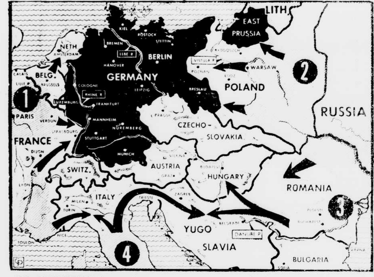
AS ONE NAZI DEBACLE follows another across the map of Europe, the hopeless plight of Hitler grows more apparent daily. This map, in which the black area shows the extent of Germany in 1938, indicates the nature and location of knock-out attacks as U. S. forces make their first thrusts into German territory...