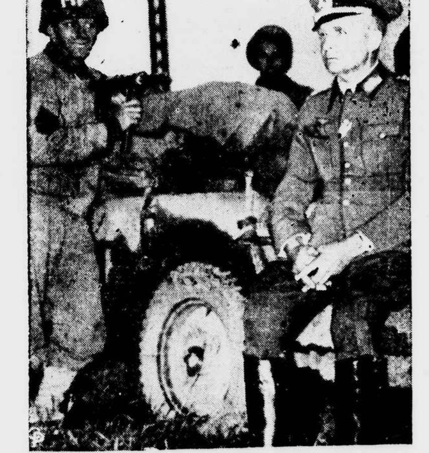
THIS PICTURE, taken outside of Fismes, France, wins the Contrast-of-the-Week prize. A grinning Yank M.P. at left thinks the captured German looks funny, but the past-tense "superman" stares grimly into space, brooding over his defeat.