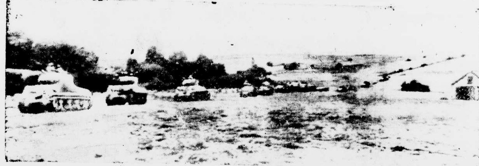
COMING TOWARD YOU OUT OF BELGIUM across Flanders fields where armies fought in World War I are Allied tanks in sinister column—one of the fearsome spearheads that penetrated the German frontier near this point and drove the enemy in on his Siegfried Line. This scene was many times repeated on the Western front as the invasion armies moved into position for the offensive that has carried them to the soil of the Reich and is building their power for decisive battles yet to be fought.