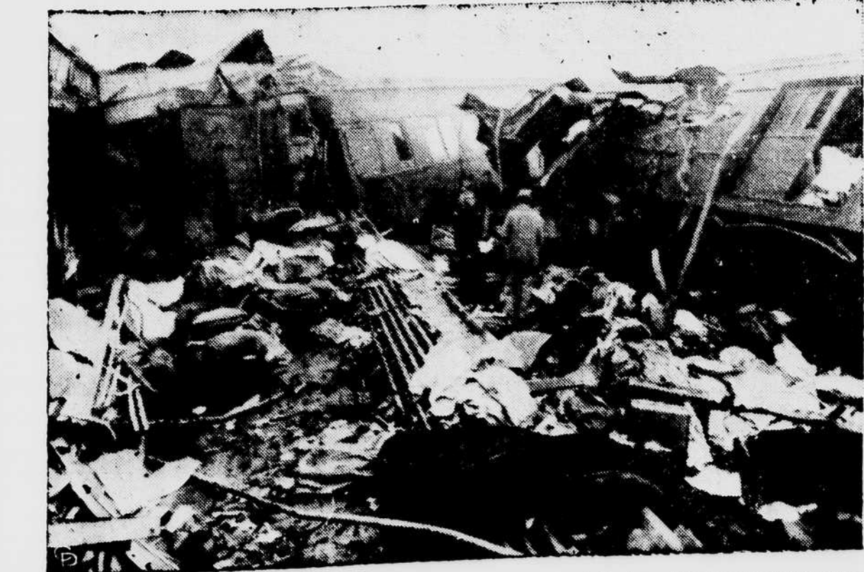
Rescue workers search through the wreckage of two fast Chicago and Eastern Illinois passenger trains that collided on the outskirts of Terre Haute, Ind., killing at least twenty-nine persons and injuring about 65 others. Twenty-three of the bodies found among the shattered cars were those of soldiers, a number of whom were overseas Air Force veterans wearing Purple Heart decorations.