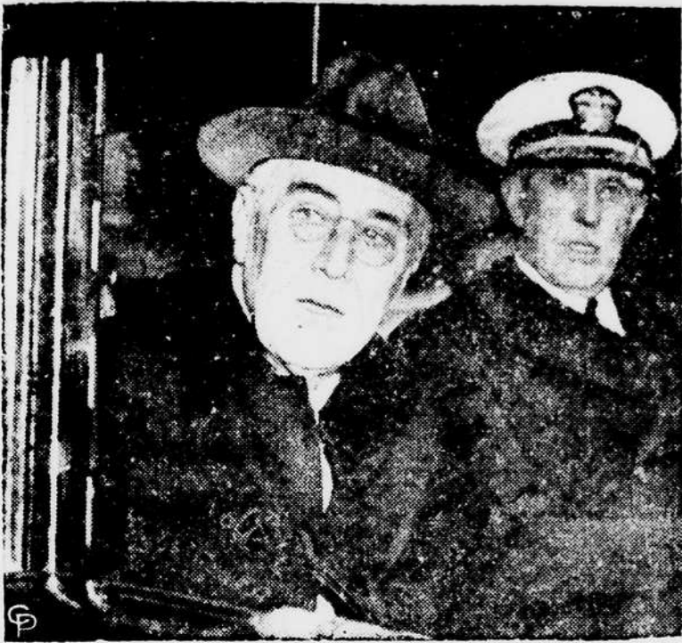
Seated in an open car, President Roosevelt, wearing his famous campaign hat, leaves the New York Navy Yard in Brooklyn accompanied by Admiral Leahy, commandant of the Eastern Sea Frontier. When the photo was taken he was just beginning his 50-mile campaign tour through greater New York City.