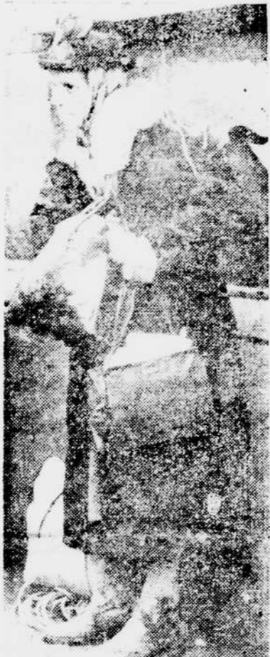
NOT SO LONG AGO you saw pictures of Polish, French, Dutch or Belgian war refugees. The fighting here has changed and today it is German refugees who are shown fleeing the battle areas. Here an elderly German woman, loaded down with her personal belongings, leaves Austria to seek safety behind the U. S. lines.