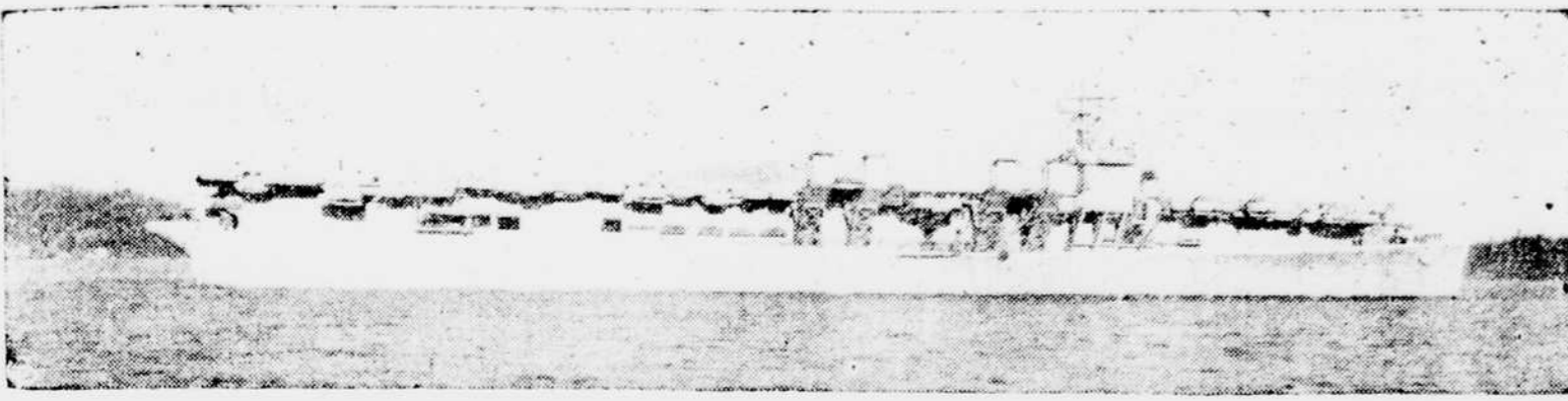
During the sea-air attack engagement between American and Japanese forces in the waters above the Philippines, the light aircraft carrier Princeton (above) was lost. Land-based Jap planes attacked her and

U. S. CARRIER PRINCETON LOST IN PHILIPPINE BATTLE