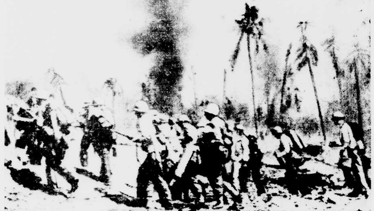
AMERICAN DOUGHBOYS unloading inland from a Leyte beach against a background of shattered coconut palms still being torn by bomb and shell are pictured in this first photo of combat troops in action on the mid-Philippine island where MacArthur's expedition began its mission of liberation. Communications report that our hold on Leyte is secure and American forces crossing narrow Juano Strait at the northeast have established a bridgehead on neighboring Samar Island.