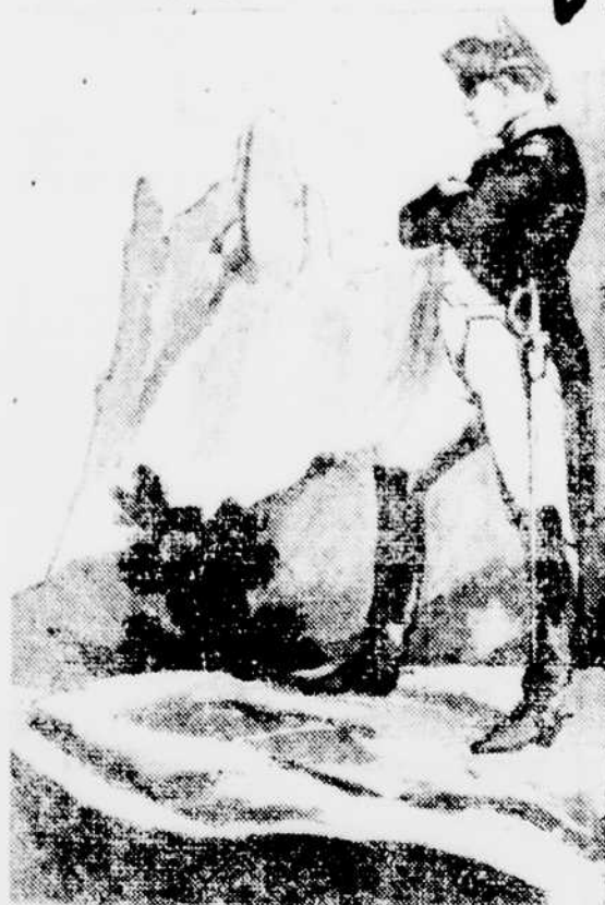
NAPOLEON'S LAST DAYS WERE A DREARY EXILE ON ST. HELENA