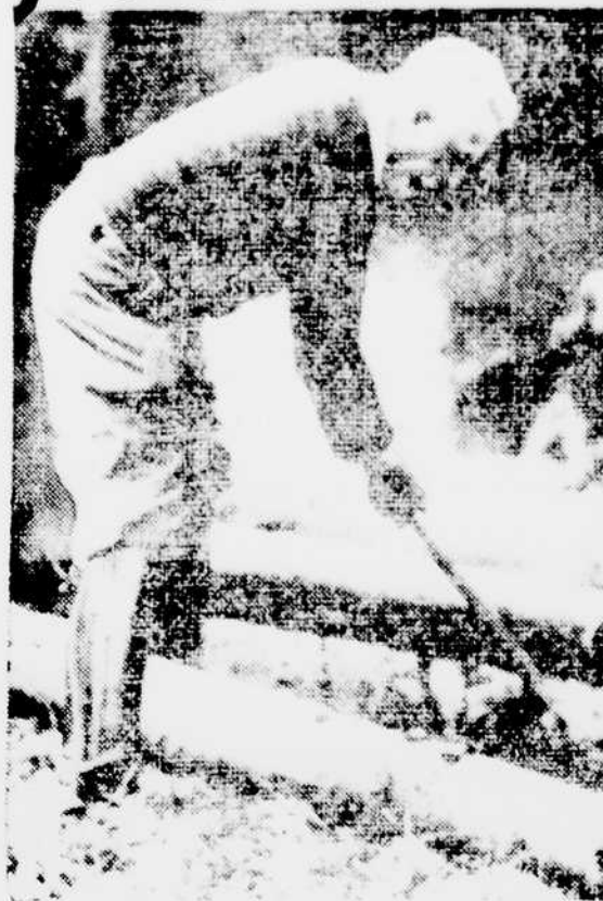
THE KAISER CHOPPED WOOD DURING HIS EXILE AT DOORN