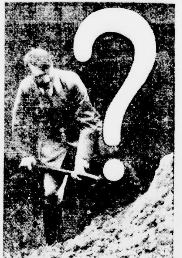
HITLER'S FATE IS IN GREAT DOUBT NOW AS WAR NEARS END

ONE OF THE EARLIEST examples of the fate of a man who has lived by the sword is that of Julius Caesar. He was captured by the Romans and led across the Alps in chains. His fate was a grim one, as he was eventually executed.