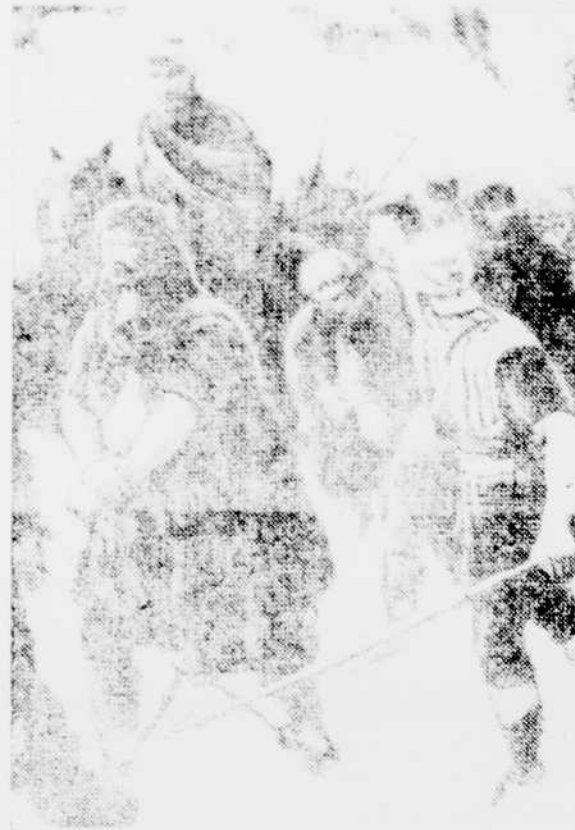
CAESAR LED VERGINGETORIX ACROSS THE ALPS IN CHAINS