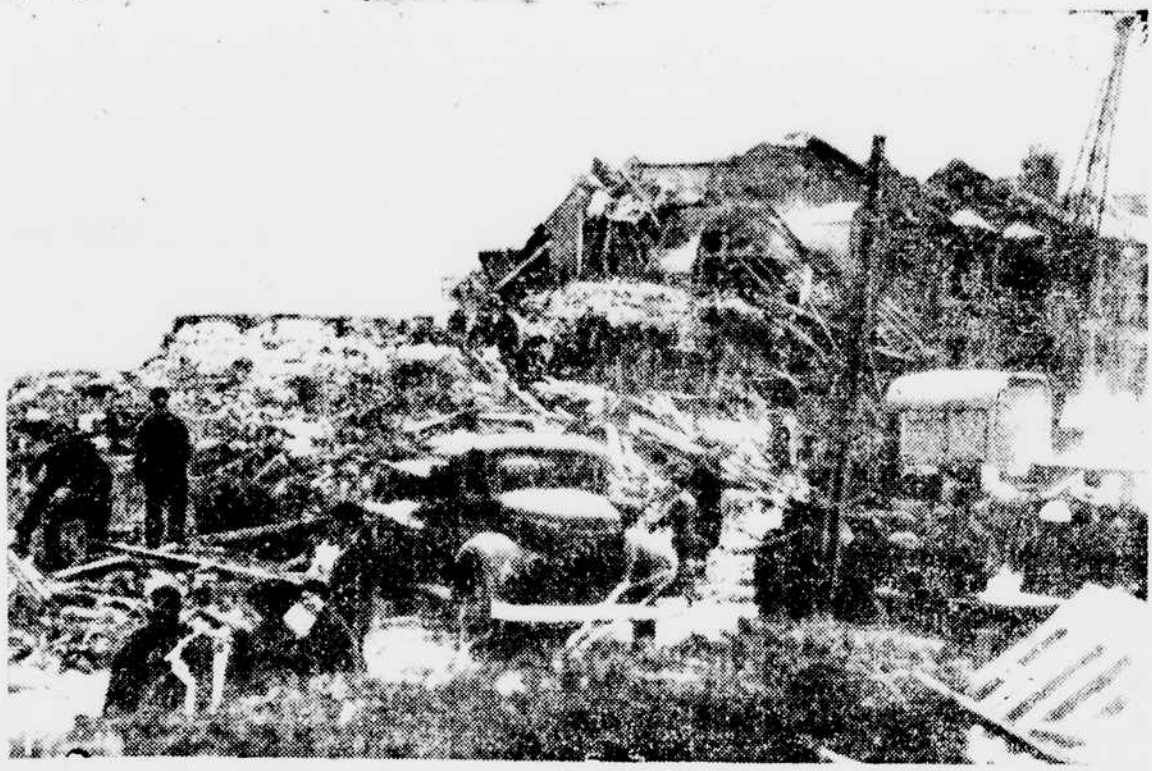
GERMANY'S LATEST TERROR WEAPON—the V-2 "ghost bomb"—has made its appearance in England and on the Holland fighting front, and the picture taken somewhere in Great Britain shows the extent of damage caused by one of the eerie missiles. The V-2 gives no warning before it strikes, since it travels faster than sound and cannot be heard; nor can it be seen approaching.