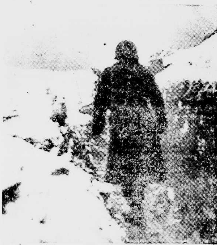
WINTER HAS COME to the Siegfried Line and now our fighters must cope with heavy snows and icy winds, as well as with the enemy. Here a doughboy stolidly ploughs along a snow-covered trench somewhere in Germany.