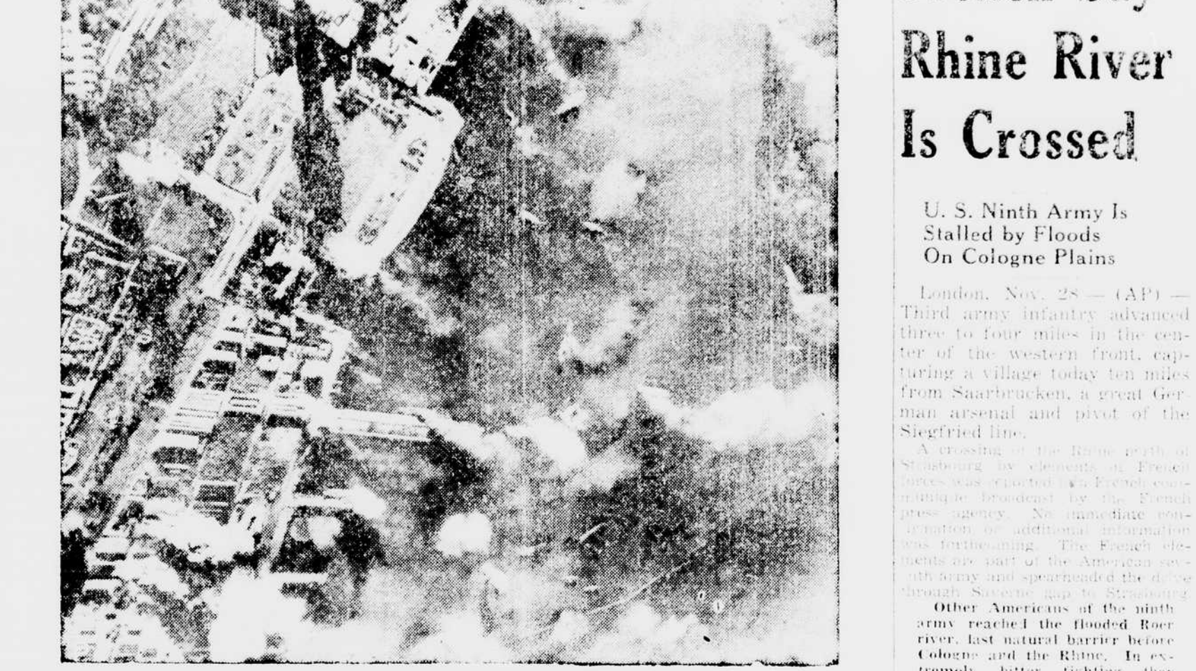
In this remarkable air photo, more than a dozen Jap ships can be seen sporting smoke and flame following the blasting given them by carrier based planes of the Pacific Fleet.