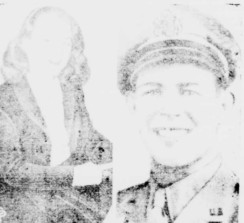
ARRESTED FOR illegally wearing a captain's uniform... (International)