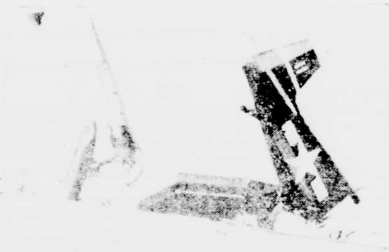
ONE WING A BELLY-TANK... (International)