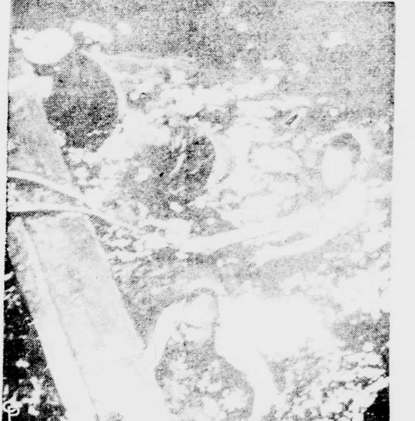
THESE JAPS seem little worried about the danger that will fall upon them...