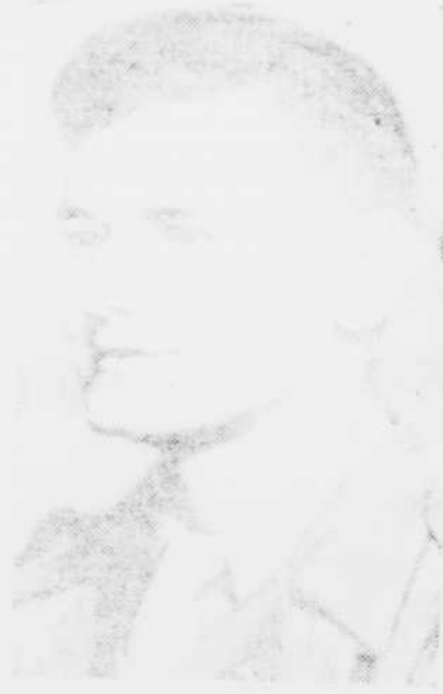
A FIRST AID MAN... (International)