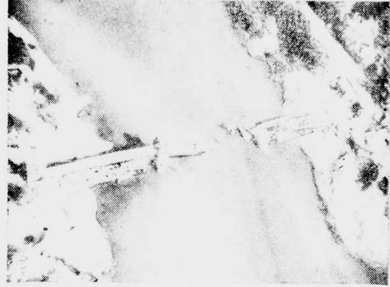
THESE PHOTOS display the accuracy of U. S. 10th Air Force bombardiers as they attacked the Hsaw Road Bridge, located between Mandalay and Lashio in Burma...