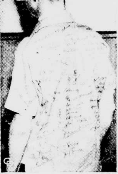
THIS SHIRT, bearing some 200 signatures of missing fighters, gave proof to their wives and kin in England that they are prisoners of war in a Jap prison camp.