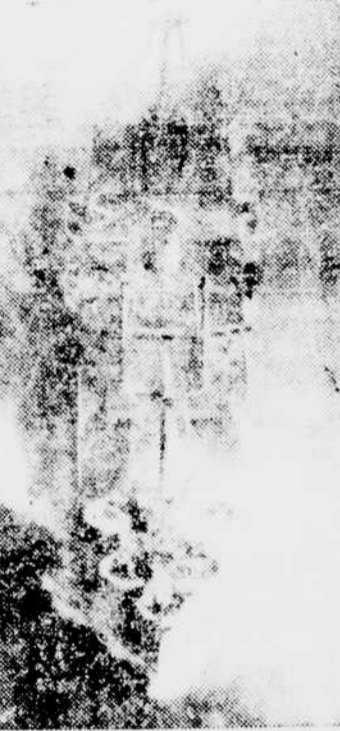
A JAP transport, caught off Formosa in one of the recent raids by U. S. carrier-based bombers, was about to go under when this aerial photo was taken.