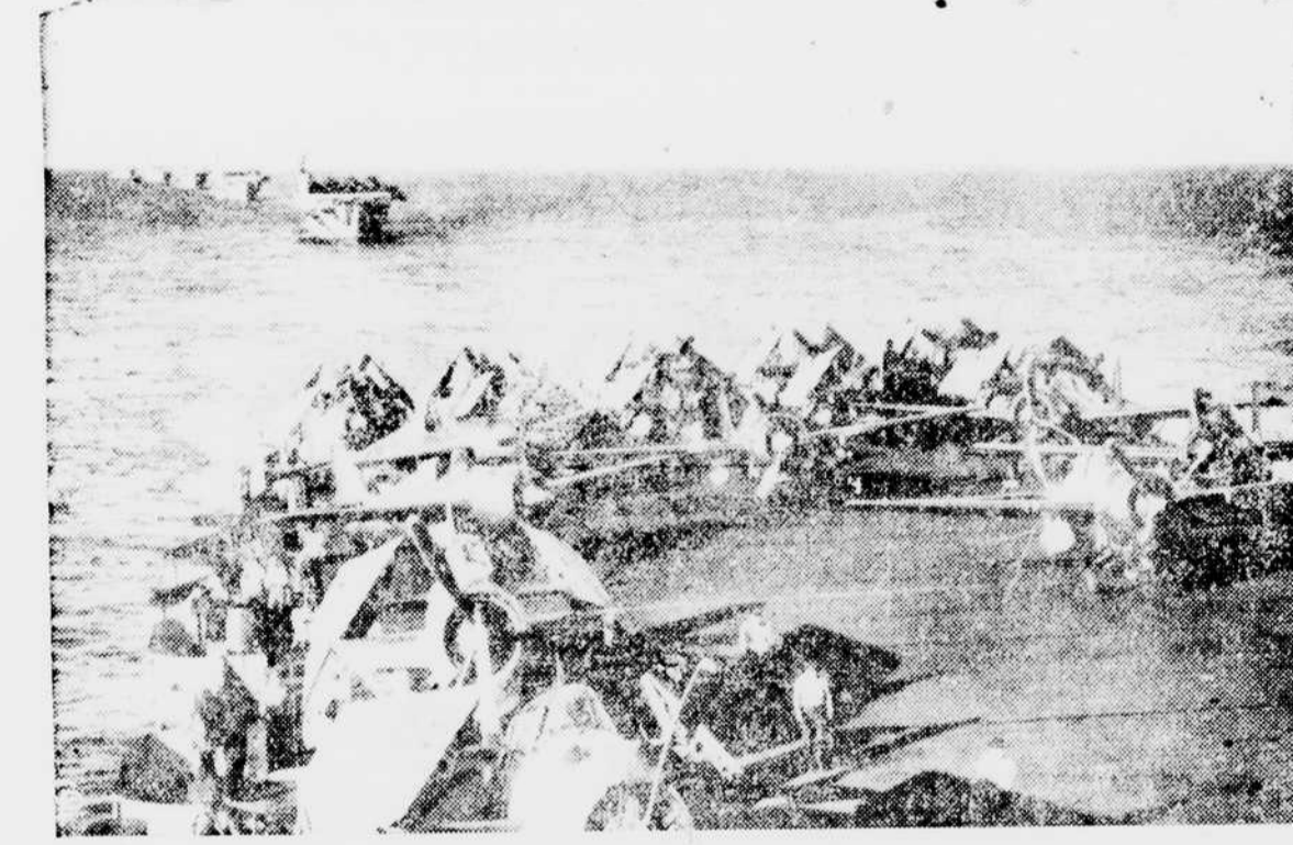
ONCOMING IN COLUMN formation visible for miles, escort carriers of the United States Navy are pictured somewhere on the far Pacific with Avengers and Wildcats clustered on their decks like ferocious hornets waiting to attack. Such a scene as this may have been glimpsed by some Japanese reconnaissance planes before Vice Admiral Mitscher's carrier-based swarms hit Tokyo with more than 1,000 tons of bombs in their nine-hour battering of the enemy capital and its environs.