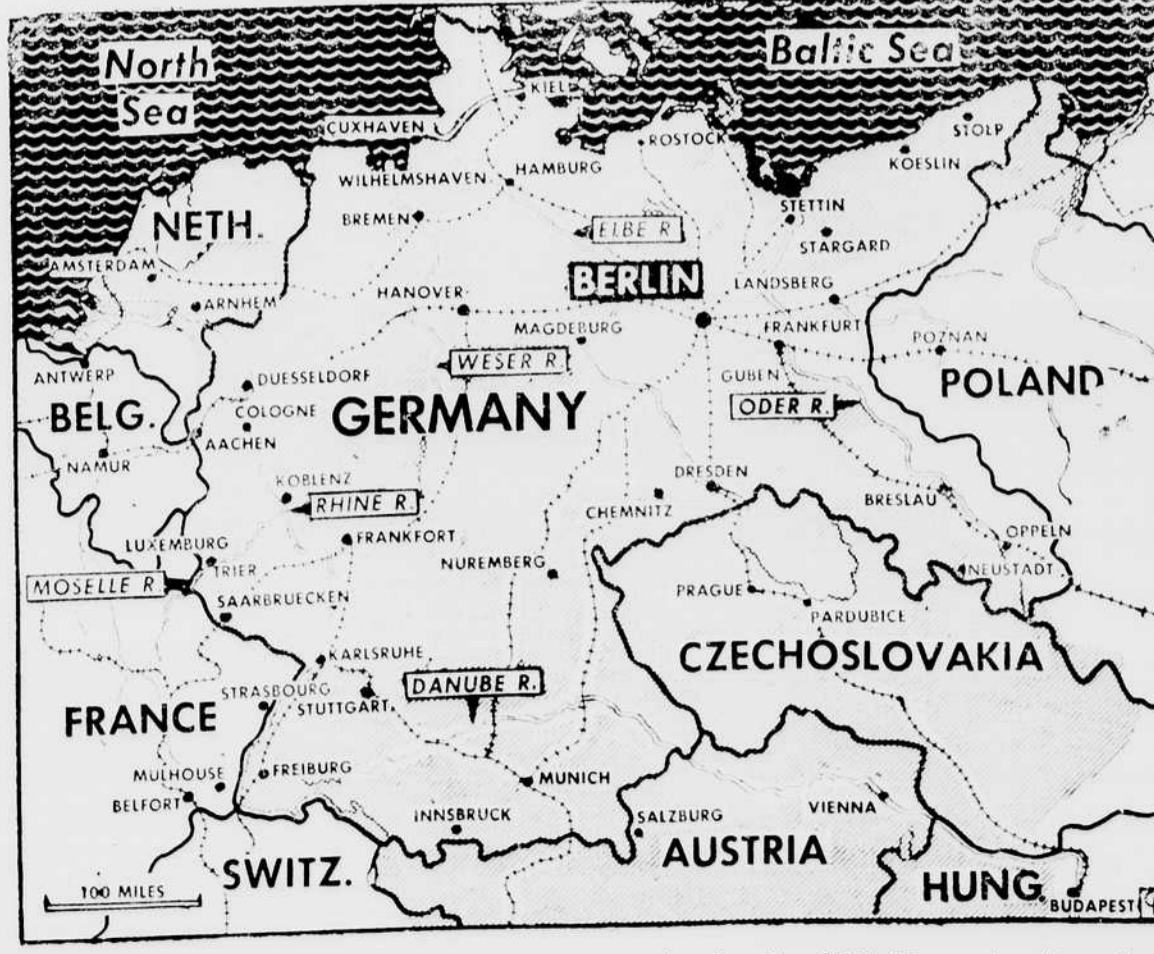
AS RUSSIAN ARMIES began to head for Berlin from both north and south and Allied forces along the western front hacked deeper into the Siegfried Line, U. S. and British bombers continued to rain death and destruction on German targets in one of the greatest air offensives of all time. More than 11,000 attacks within a two-day period have linked the eastern and western fronts under a blanket of explosives.