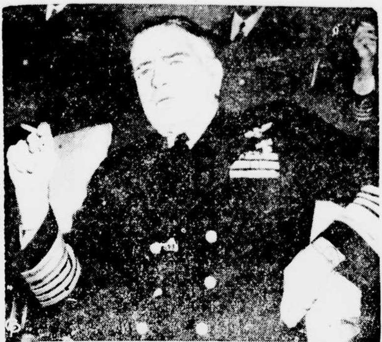
ARRIVING IN WASHINGTON on a surprise visit, Adm. William F. Halsey, Jr., Commander of the Third Fleet, is shown here during a press conference in the Navy Department...