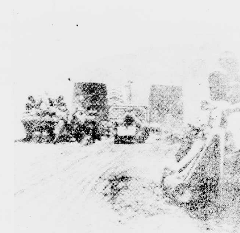
Men on the Lohndorf bridge at Bonn, Germany, look on as the U. S. 9th Army and their equipment rush over the Rhine river to the care of the Luftwaffe, March 12.