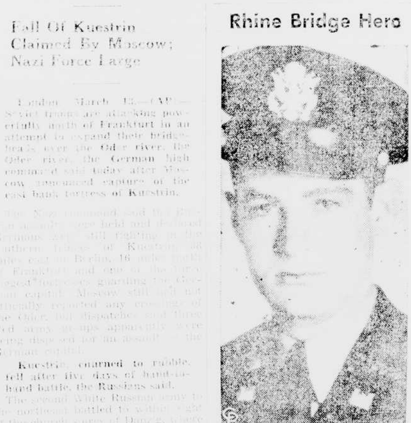
HERE IS the daring young fellow who persuaded the German troops to throw up the Lohndorf bridge of Bonn and thus made possible the spectacular Rhine crossing by the U. S. 9th Army.