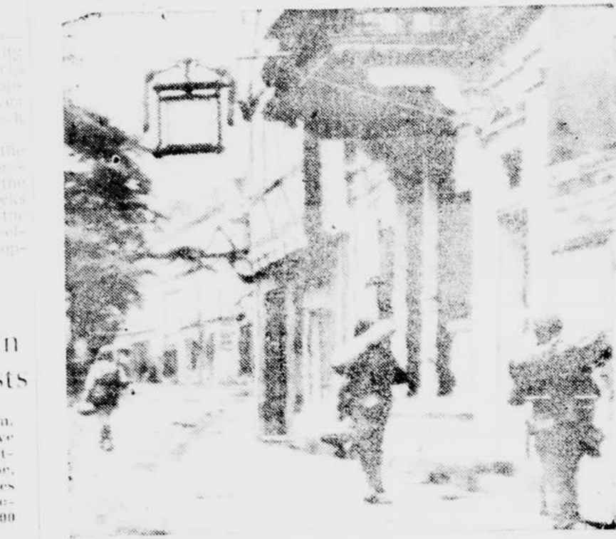
WHILE UNDER CONSTANT SHELING by the Germans, troops of Gen. Holzer's First Army advance through a street in Hounel on the east bank of the Rhine River, after crossing the Ludendorff Bridge. These troops are now closing in on the strategic Frankfurt-Ruhr six-lane highway.