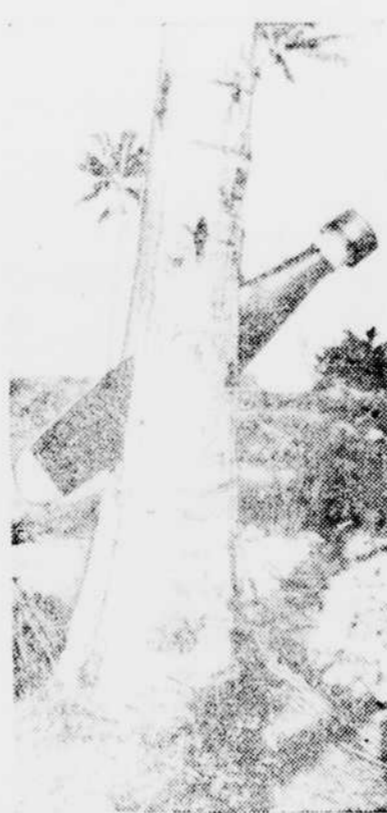
BELIEVE IT OR NOT! This unusual front-war picture was made possible when a propeller blade broke loose from the rotor shaft and was driven through the trunk of a coconut palm tree at a South Pacific base. The plane lost the blade when it swerved off the runway in a crash.