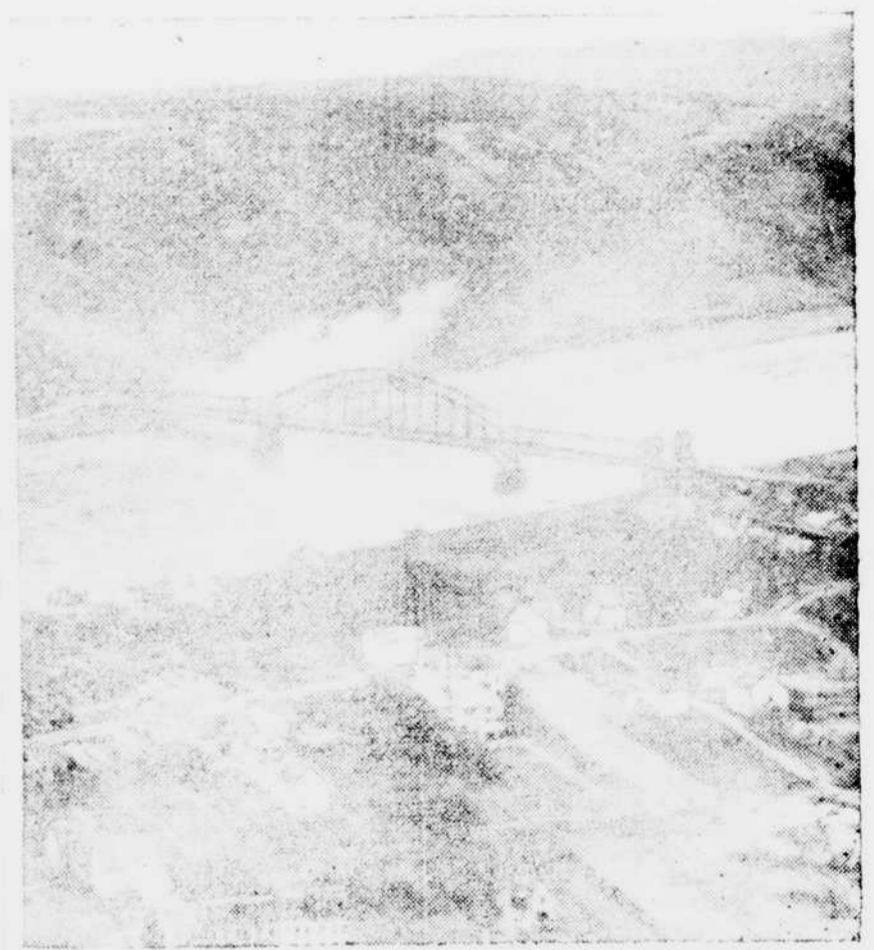
The American first army in its expanding Rhine bridgehead, deployed tanks on the super-highway connecting Frankfurt and the Rhine, 100 miles away from the city of Frankfurt. The remnants of the southern end of the bridgehead, now 12 miles long and seven deep, held Frankfurt, Bismarck and Hohenfels. United States units were within three miles of open plains leading north to the Rhine. House to house fighting raged in Bismarck. The only there was using anti-aircraft guns and anti-tank guns and the first time in the bridgehead fighting a first tank battle since early in the war.