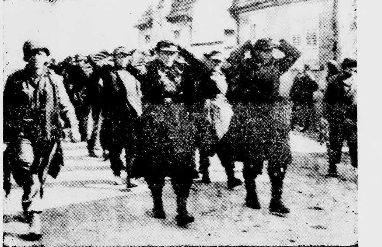
Escorted by U. S. Third Army soldiers, some of the first Germans to be taken prisoner on the east bank of the Rhine are shown being marched away from the battle area. They were part of an entire battalion who refused to fight and surrendered to the Allies.