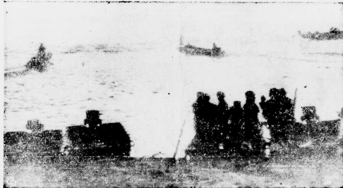
American Ninth Army troops are shown as they started to cross the river, south of Wesel, in outboard motorboats. Eisenhower's armies now have four bridgeheads across the Rhine along an approximate 175 mile stretch of Germany's last barrier in the west.