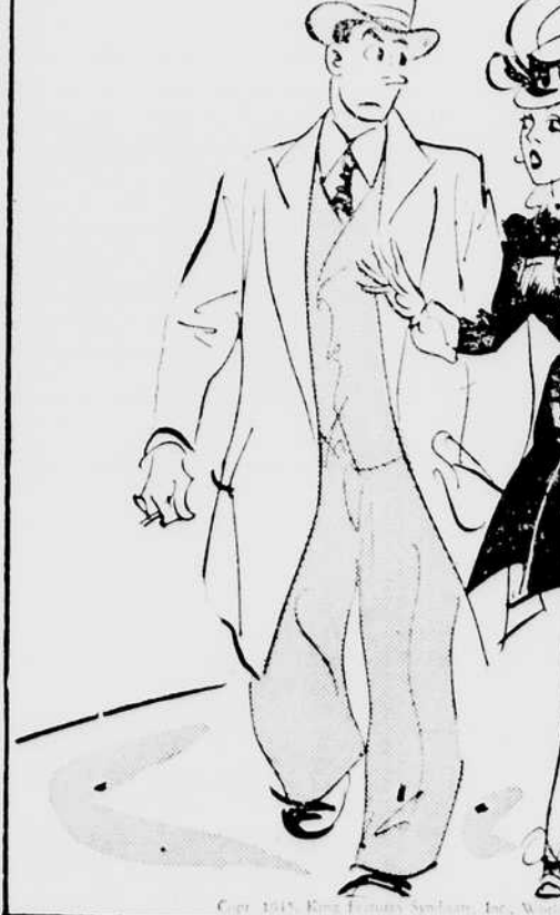
"Remember, George, you won't like mother and she won't like you. So just keep your big mouth shut!"