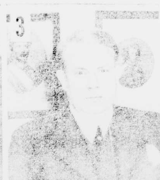
2 AIDED BY TRAITORS such as Valentin Gollub, Germany invaded Poland and Denmark April 9, 1940. Denmark fell May 2, 1940.