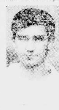
Englander in 1931