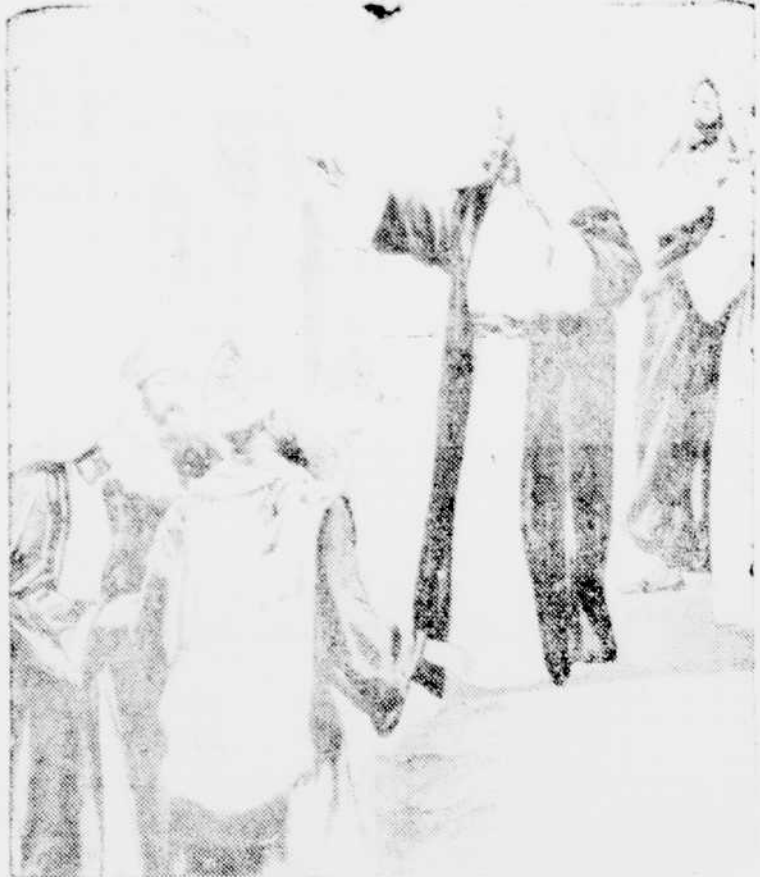
The apostles preaching in Jerusalem.

"Follow after righteousness, godliness, faith, love, patience, meekness.—1 Tim. 6:11.