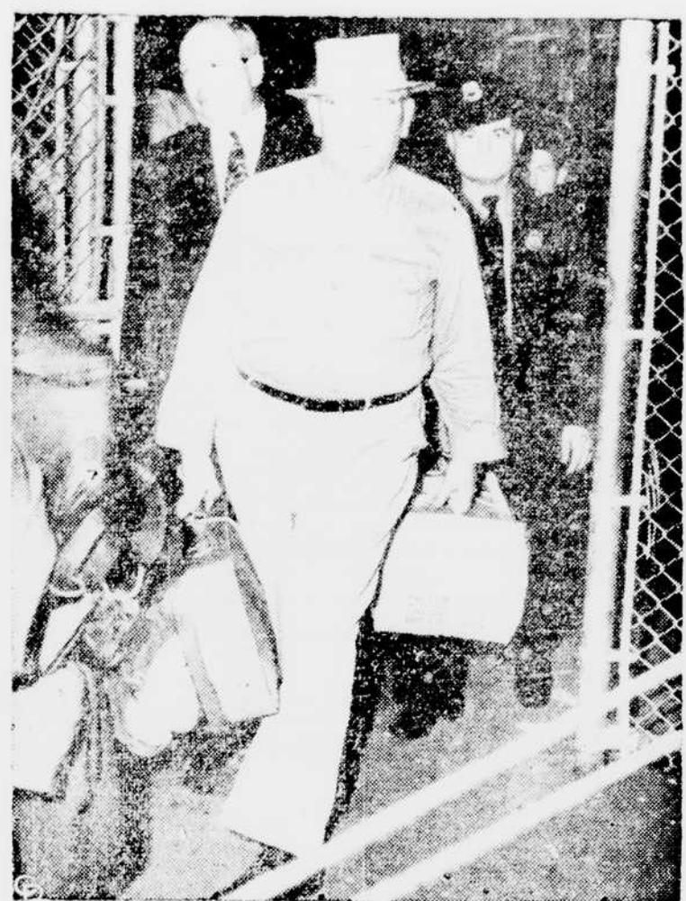
THE MAN WHO THOUGHT he could run the United States with the Gestapo, Fritz Kuhn is shown as he is escorted by police to the ship he headed back to his homeland after moving from England, August 30. Other Germans were with him.