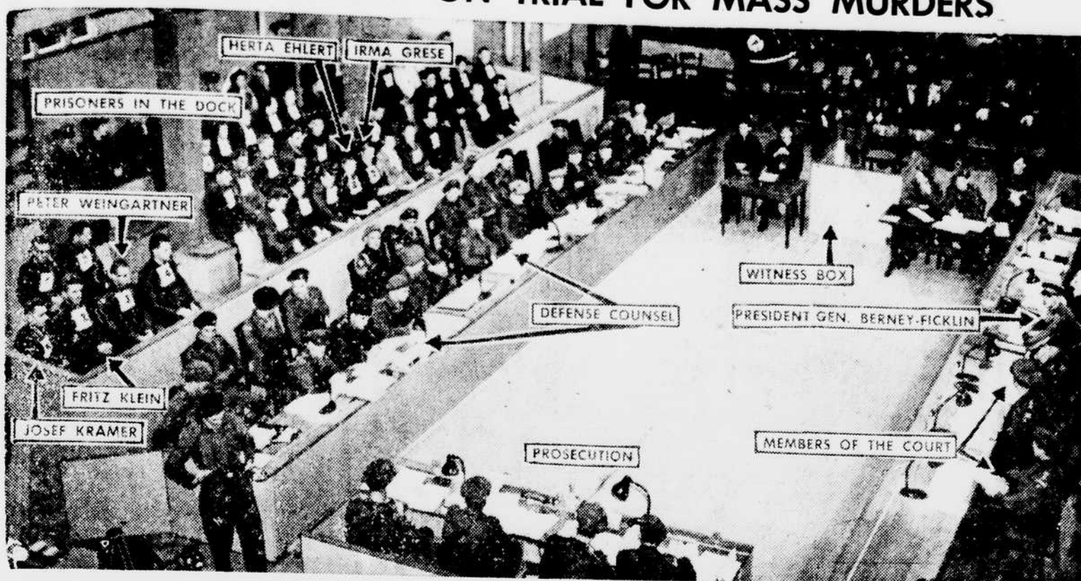
HERE IS A DETAILED PANORAMIC VIEW OF THE courtroom in Luneberg, Germany, where British prosecutors are conducting the first great war criminal trial. The 44 Nazis charged with responsibility for the Belsen war camp atrocities are shown at left wearing identification numbers, and the No. 1 spot is held by Commandant Joseph Kramer, who has become known as "the beast of Belsen."