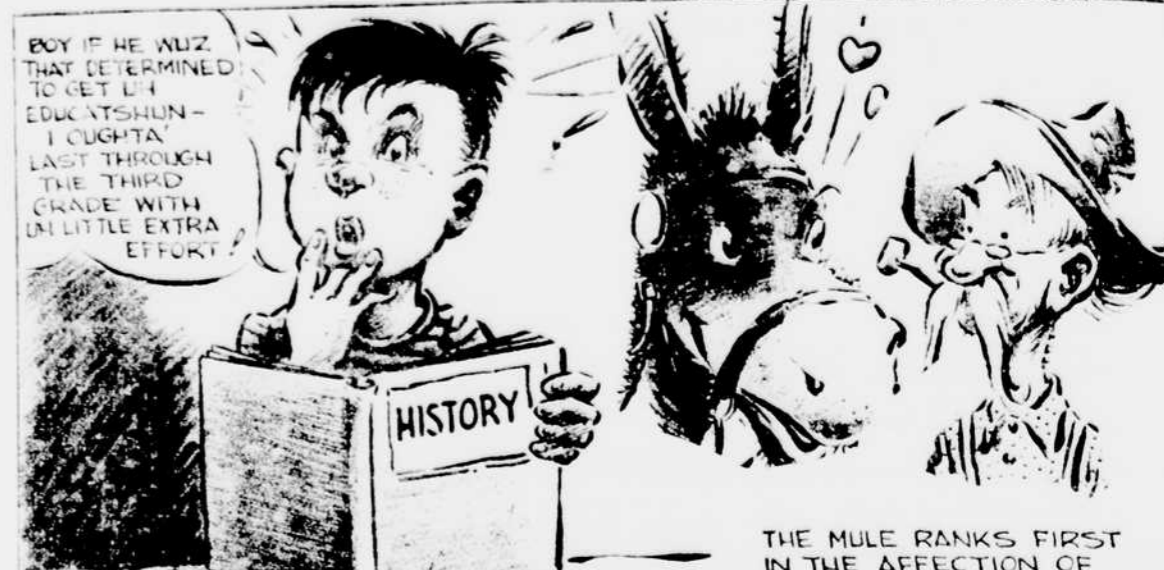
THE MULE RANKS FIRST IN THE AFFECTION OF NORTH CAROLINA FARMERS. CUTNUMBERING THE HORSE NEARLY 5 TO 1!

THE FIRST STUDENT TO ENTER UNC 30 DAYS AFTER IT OPENED IN 1795 WAS HINTON JAMES WHO WALKED 200 MILES FROM WILMINGTON TO MATRICULATE!