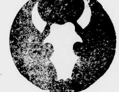
Red Ball 24th INFANTRY DIVISION (Red Ball)

First... "What They Did In War" by Red Ball