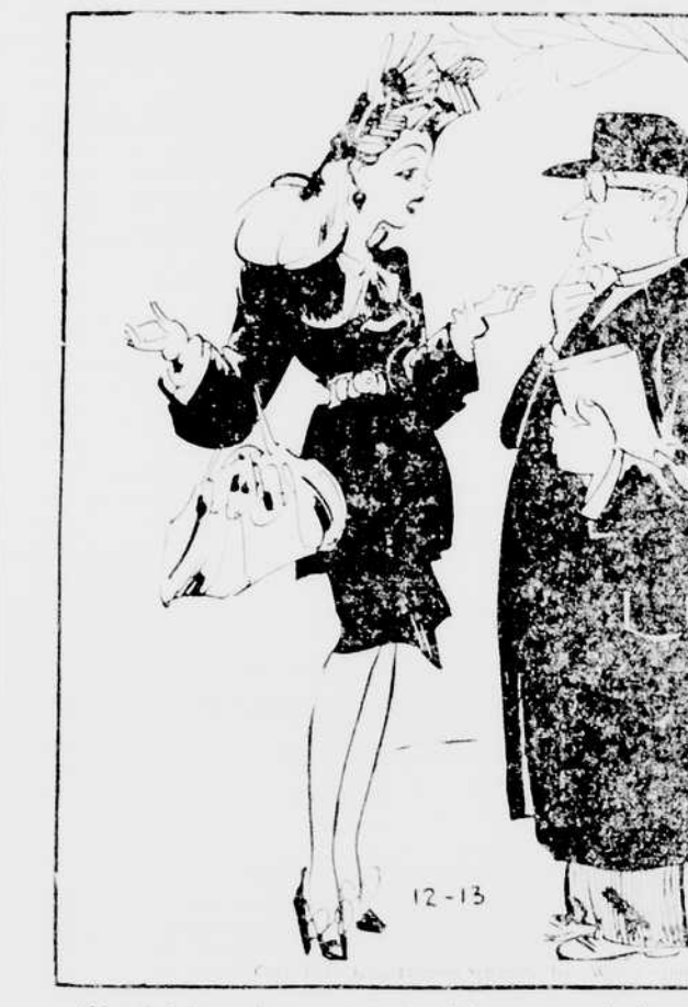
Until I heard your wonderful sermon, I thought Sodom and Gomorrah were man and wife.