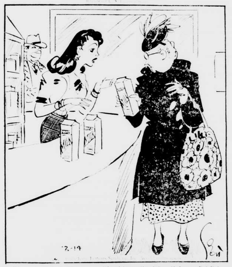
"There's nothing wrong with this milk. It's all been PARALYZED by a government ANARCHIST!"