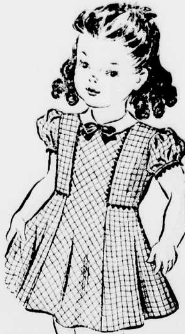
9483 SIZES 2 to 8