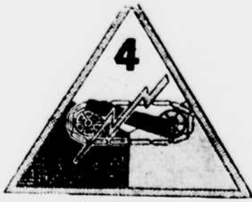
4TH ARMORED DIVISION

The division which hammered through the German ring of steel to rescue the beleaguered 101st Airborne at Bastogne. With the 3rd Army, crossed the Rhine near Worms. Seized intact a bridge across the Main river. Drove to Hamau, to seize east of Frankfurt-am-Main. Six months after entering campaign, men of the 4th had earned 1,269 decorations. Record bag of prisoners for one day totaled 3,000.