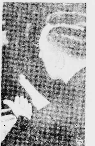
RARELY, if ever, has the camera recorded a brief chapter from a strange psychological "case history." Here, with back turned to the lens—because his doctors will not allow photographs—is the portrait of a man in search of his memory.