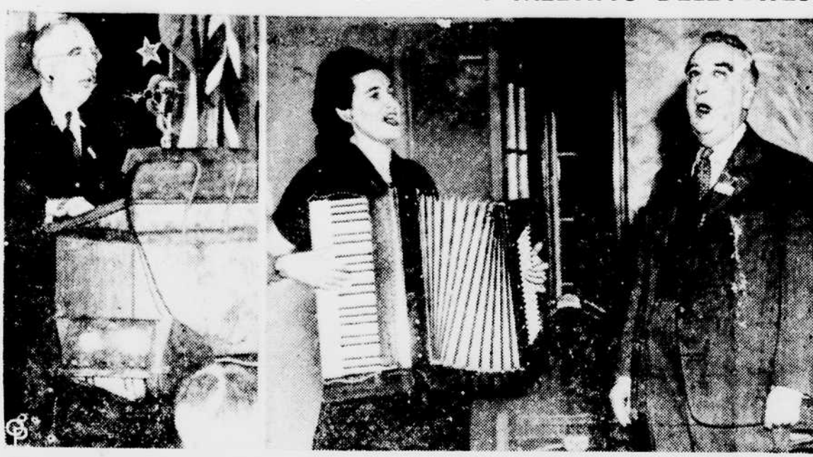
SECRETARY OF THE TREASURY Fred M. Vinson is pictured (left) as he addressed the opening session of the Board of Governors of the International Monetary Fund and the International Bank for Reconstruction and Development at Savannah, Ga.