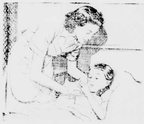
Home Nursing. The Red Cross teaches the fundamentals of home nursing to many citizens. Mothers and high school girls learn how to care for simple illnesses, and how to follow the doctor's instructions in preventing serious ones.

Each of the 3,754 chapters in the nationwide Red Cross network... just as our local chapter... did its full share to make possible all the help and comfort given our fighting men. But that is only half the story. Here is what your Red Cross chapter is doing now and will be doing for years to come.