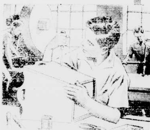
Junior Red Cross. From eager first-graders to high school students young volunteers stitch, hammer, and plan for the Red Cross. Many also learn first aid, accident prevention, water safety, nutrition, and home nursing.

Volunteer Special Services. Your neighbor next door or just around the corner is probably a member of one of the many Red Cross Volunteer Corps. She may sew or knit for our hospitalized men; she may drive for the Motor Corps; she may be a Nurse's Aide or a Gray Lady. Perhaps she's a Staff Assistant, or a Home Service worker... but whatever corps she serves... whatever she does... her time and effort help stretch the Red Cross dollar.