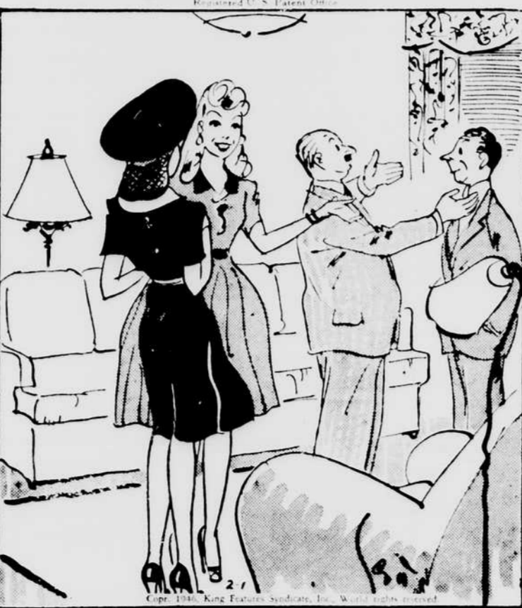
"When your father's a fisherman, the boy friend must be a good listener."