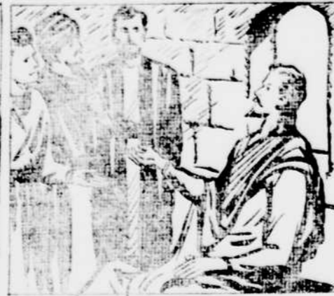
Jesus rebuked Peter, Simon and James and John, sons of Zebedee. He named them Boanerges, meaning Sons of Thunder.