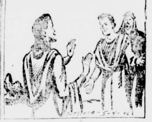
"The Son of Man is not come to destroy men's lives, but to save them." MEMORY VERSE—I John 4:7.