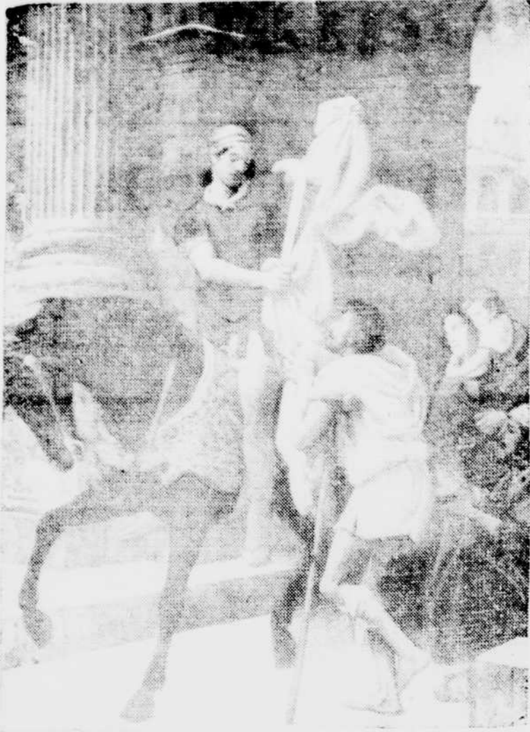
Charity of St. Martin.