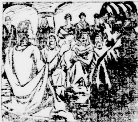
Jesus remained twelve, that they should be with Him, and that He might send them forth to preach.

Scripture—Mark 3:14-17; Luke 9:49-56; I John 4:7, 8.