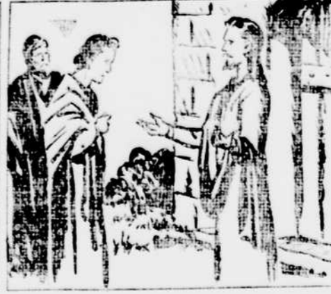
John told Jesus that he had forbidden a man to cast out devils, in His name, and Jesus rebuked John.