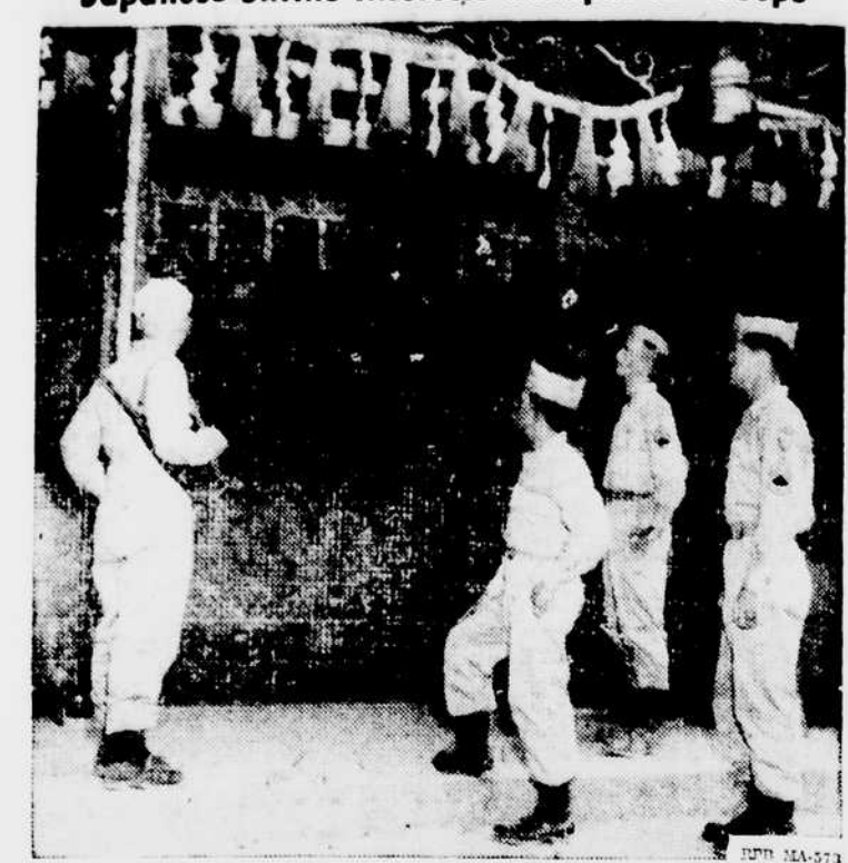
The Army Regulars pictured above are "taking in" the sights of e shrine at Shiogama, Honshu, in Japan. "Guardians of Victory" who join for three years have their choice of overseas theater.