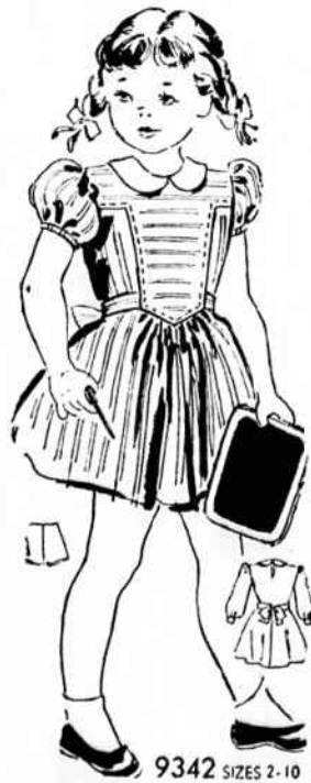
9342 SIZES 2-10

Mother, you know how it is... you always want your moppet to look pretty but she grows too hard! Don't despair! Sew Pattern 9342, a dress that takes to sturdy fabrics!