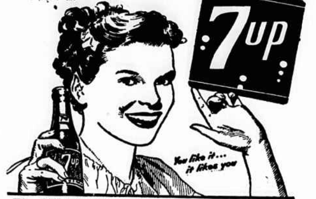
The SEVEN-UP Bottling Co., of Littleton, N. C.