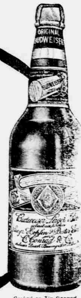
Corked or Tin Capped