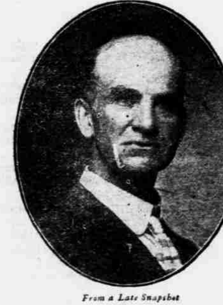
To see all of his regular Patients and such

fidential, Invited and FREE. ONE DAY ONLY.