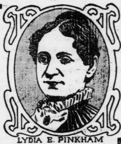
LYDIA E. PINKHAM

a more potent remedy in the roots and herbs of the field than was ever produced from drugs. In the good old-fashioned days of our grandmothers few drugs were used in medicines and Lydia E. Pinkham's Vegetable Compound, in her study of roots and herbs and their powers over disease discovered and gave to the women of the world a remedy for their peculiar ills more potent and efficacious than any combination of drugs.