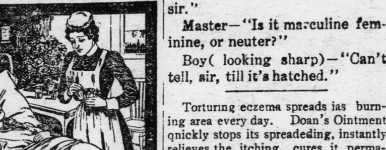
table Compound has done for me.

inine, or neuter?" Boy( looking sharp)-"Can't tell, sir, till it's hatched." Torturing eczema spreads ias burn-