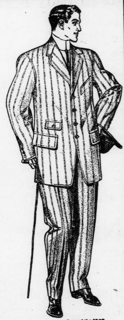
Copyright 1903 HAMBURGER BROS. & Co. Baltimore, Md.